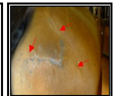
at the end