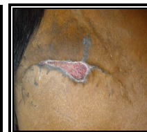
at 28 days