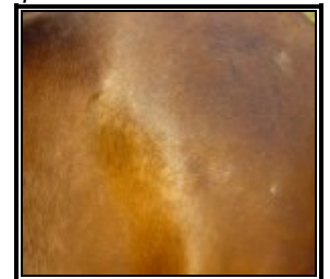
After 6 weeks of use

Tear on the buttock caused during a transport. One necrotic zone appeared with the withdrawal of the sutures points.