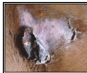
Before using EQUICURE C

Scratch on the side caused by repetitive friction.